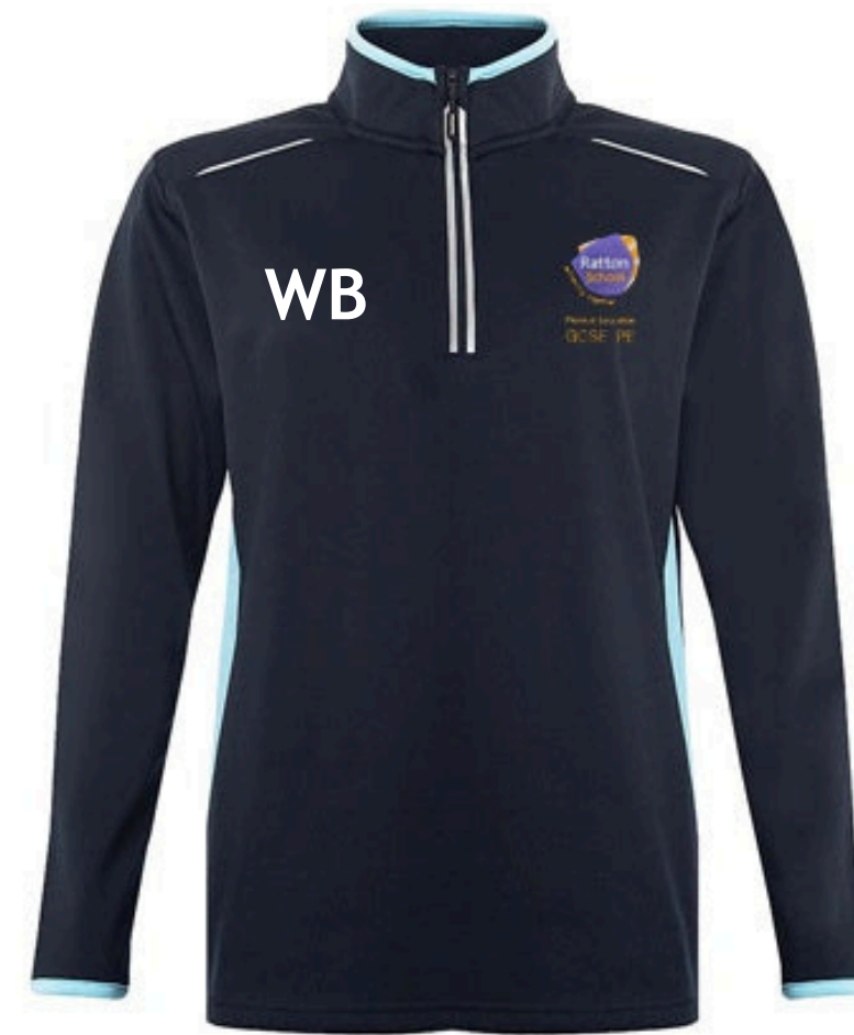
Training top - with initials on the front