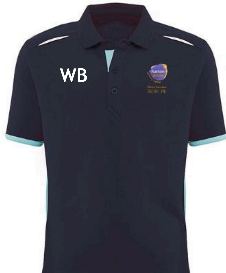
Polo shirt - with initials on the front and allocated number on the reverse.

Exclusive CNAT PE kit is available to pupils who follow the course. These are not compulsory but are proudly worn by many of our current accredited PE candidates in their core, GCSE and eventually CNAT PE lessons.