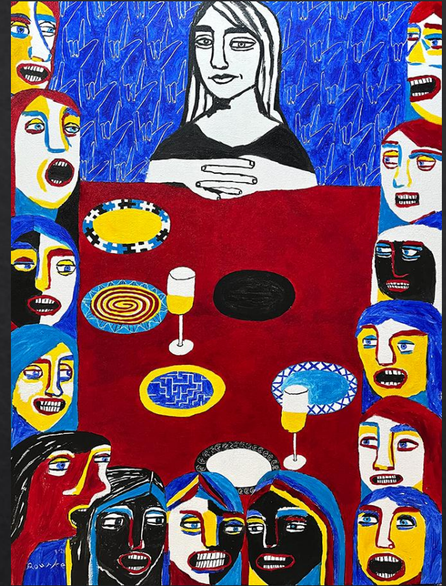
Nancy Rourke- Dinner Table Syndrome